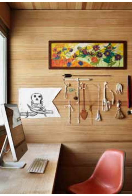
ABOVE The modern boy's bedroom: powder-coat steel shelving by Pollen Architecture and cabinetry by Hatch; pirate flags and knots by James Young. FACING PAGE This is where the family usually gathers when company comes over — table by Macek Furniture Co., painting by Michael Young, lamp by Muut.