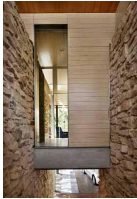
LEFT A view into treetops from the living room; custom steel bookshelves by Pollen Architecture, rolling glass doors by Fleetwood and table and chair from Scott + Cooner. ABOVE An entry stairwell gives a glimpse through house. FACING PAGE The living room hovers over the carport entry that features stained cypress wood cladding.